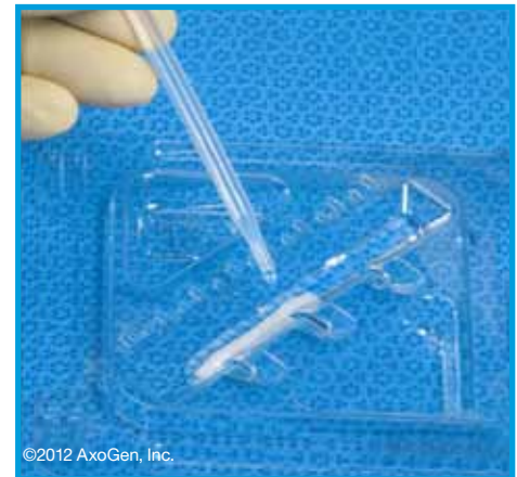
Figure 2: Preparation of Avance® Nerve Graft.